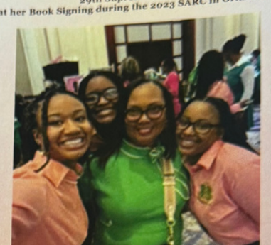
Mentoring is a special & unique part of the Undergraduate & Graduate (GAC) experience. Hanging out with these Alpha Beta Sorors at the 2023 Cluster V Meeting, Atlanta, GA.