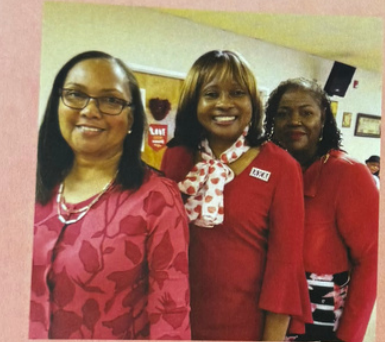
Pink Goes Red for the Day!!